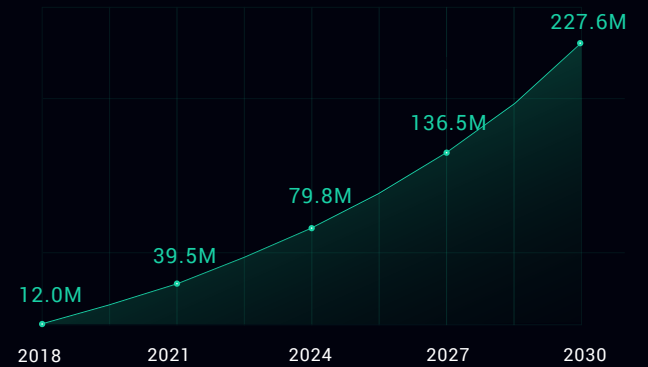
Global electric vehicle fleet